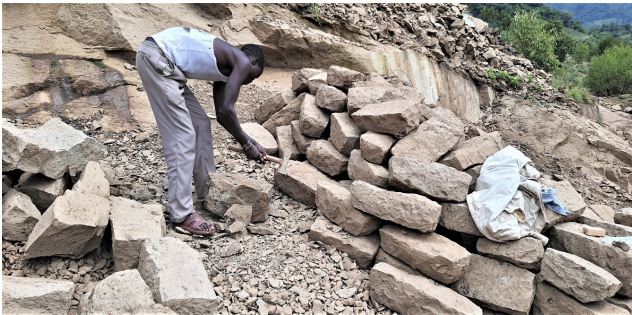
Plate 1: A quarry worker in Sangarau site going about his daily activities without protective gear

From the study, only 23.2% of quarry workers and 6.8% of household heads were aware that all persons working in a quarry must adorn protective gear. In addition, 84.1% of all the quarry workers interviewed did not use any protective equipment, with the majority arguing that the area was very hot and due to the nature of their work, they would sweat a lot, thus disregarded helmets and boots. The quarry workers also claimed that none of their employers provided protective gears forcing them to convert their clothes into nose or mouth masks when blasting and dry seasons because the dust is always up. The finding is contrary to sections 99 and 101 of Kenya's occupational safety and health Act No. 15 of 2007 (Revised 2010) that requires employers to provide their employees working in quarries with protective gear and first aid kits.