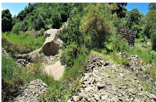
Plate 2: An abandoned quarry close to an old house structure

A few household heads noted that the 50m quarrying distance from homes was observed in some cases, primarily when the landowners or neighbours raised the alarm. However, the majority decried that the rules were not observed and that quarry workers were more interested in the gains while neglecting the social and environmental implications of stone quarrying. Some household heads recognized the efforts of a few quarry workers that refilled depleted quarries, although it was done to a small extent and when forced. Furthermore, the household respondents argued that due to their low awareness of the law, they assumed the quarry workers and quarry owners adhered to the rules and regulations because no one had ever been incriminated, fined, or arrested in relation to quarrying operations.