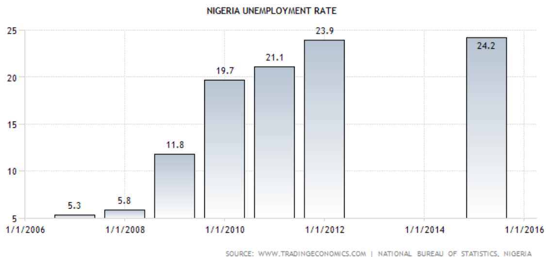
Figure 2: Unemployment Rate Graph

The graph below shows a range of unemployment rate from 2006-2015