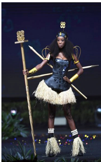
FIGURE 9 Cultural outfit worn by Miss Ghana 2018

These symbolisms provide the pillars for strong identity. One of the early African fashion queens was Mary Oriego Manduli, who has been referred to as 'Mama Afrika' because of her style. The former Safari rally driver, Ambassador and farmer, has provided a consistent face of African fashion, characterised by oversize headgear and fine fabric from West Africa as can be shown in Figure 10. She loves kitenge because she believes it is the only fabric that is uniquely African.