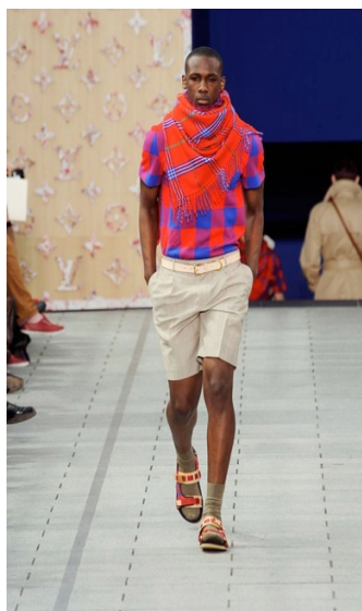
FIGURE 6 Maasai shuka inspiration by Louis Vuitton 2012

businesses and products needs seek permission from the elders. The same applies for photography and filming of their cultural events. Therefore, the use of Maasai culture and other cultures can be beneficial to the communities if structures are put into place.