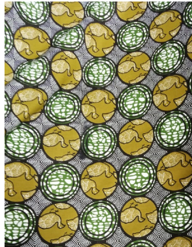
FIGURE 3 Kitenge fabric with khanga motif from Rivatex Kenya

that continues producing the local fabrics being promoted as part of the renewed cultural diplomacy (Amolo, 2019). The factory produces cotton fabric with African inspired patterns and prints as can be seen in Figure 3. They have supplied a variety to the head of State, President Uhuru Kenyatta, who happily adorns them every Friday.