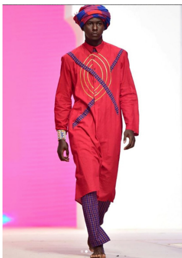
FIGURE 4 Maasai shuka nomadic inspiration by Kikoromeo, FIMA 2018

The Maasai shuka is a chequered red fabric that was appropriated by the Maasai tribe and has become their trade mark. It is typically accessorized with jewellery that has gained international appeal (Wa Gacheru, 2020). It has spread all over the world and is often featured in local/African fashion to the extent that Joy Mboya, in her reflections on the Kenya National Dress felt that it should not have been overlooked (Mboya, 2019). Maasai shuka print was evident in the Kikoromeo collection, 'Desert Rhapsody' in 2018 Festival International de la Mode Africaine (FIMA) (Kikoromeo, 2019). Figure 4 shows a model in Maasai headgear, fine print trousers and abstracted Maasai cultural features on the garment.