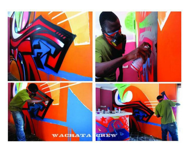
FIGURE 17 Wachata Collective in action

design and print t-shirts to meet the huge market demand for their designs. They hold graffiti classes on Saturdays at the Makutano Arts & Crafts Centre in Oyster Bay and at Nafasi Artspace in Mikocheni. The Tanzanian audience prefers Wachata art especially in corporate advertising and advertising campaigns because of its organic and authentic feel. People refer to their work as pieces of art ( Figure 17 ). This success has been achieved by the WCT principles of its work (Graffitisouthafrica, 2013).