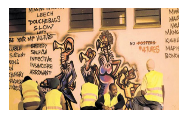
FIGURE 5 Kenyan graffiti artists Swift9

political corruption (visualartscork, n.d.).