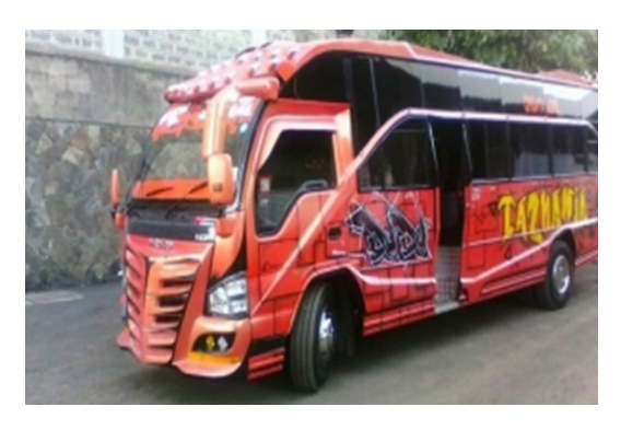
FIGURE 11 Mohammed Kartar Tazmania artwork

Then transport minister, John Michuki, first introduced the Michuki rules in 2003 (Aradi, 2018). The National Transport and Safety