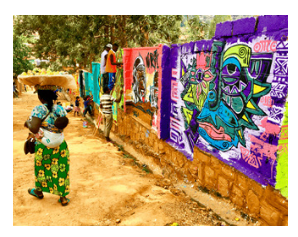
FIGURE 18 Street scene in Kigali during the Kurema , Kureba , Kwiga event

and exhibits to promote the integration of art and activism (Feiger, 2017).