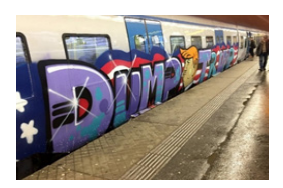
FIGURE 2 Graffiti on a Swedish subway train

(Wambugi, 2017). This art form became appealing with drawings of people dominating the walls of urban settings all over the world. The artworks were done on subway trains, walls, industrial wastelands, subways and billboards. Graffiti has now spread globally in major cities, and in some, it is celebrated as a work of art (Figure 2 (visualartscork, n.d.).