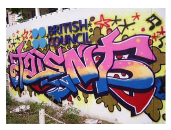
FIGURE 16 Wachata Collective work at the British Council

WaPi was sponsored by different organizations and NGOs (Figure 16). It was able to create a foundation for underground creativity through visual arts and speech. It also enhanced confidence and excitement among the youth. In the history of graffiti and hip-hop in Tanzania, WaPi was the one and only place that offered free materials (spray cans, masks and markers) and white walls to paint on (Graffitisouthafrica, 2013).