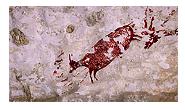
FIGURE 1 Oldest cave painting ever discovered (4400 years old)

Despite a proliferation of contemporary arts in Africa, in the East Africa region, literature on graffiti art is scarce. Unique in form, graffiti is also called spray can art, subway art or aerosol art. This is the decorative imagery done by paint or other means to buildings, public transport or other property. Buule (2018) states that graffiti can be a writing or drawings scribbled, scratched, or sprayed on a walk way or a wall or other surface in a public space. Graffiti origins have been linked to the classical Antiquity and Prehistoric times (Figure 1). Some scholars debate that in ancient times, graffiti displayed phrases of love declarations and simple words of thought (Buule, 2018). This came with the advent of written language and wall paintings (visualartscork, n.d.). The desire of people to leave their mark on walls however has been around for thousands of years. Archaeologists have found graffiti scratched on walls in the city of Pompeii as old as 1908. Contemporary street art beginnings can be traced to tagging, scratching initials or a name on public property in the late 1960s (Buule, 2018).