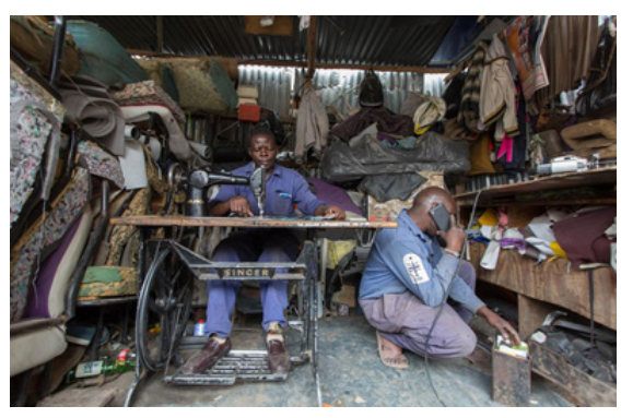
FIGURE 10 Workers sewing in the upholstery and interior design section at Moha's garage

Eventually, he was getting a car to work on each month. He made the decision to move his workshop back home. He added employees as soon he was getting orders of up to ten cars at once. This led to him looking for an actual garage as his neighbors complained of the paint smells and the pollution. He acquired a garage near his home for a year. In 2005, he moved to his current garage in Eastland's Industrial area, Nairobi as shown in Figure 10 (Glader, 2017).