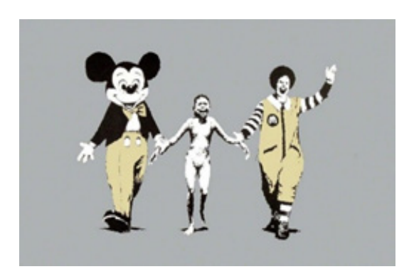
FIGURE 4 Banksy's Napalm done in 2004 Source: Indrisek 2019

with complex cultural agendas. It is also seen to be as anarchistic self-expression ( Figure 4 ). One of the most renowned work in this category is that of the famous UK graffiti artist known as Banksy (visualartscork, n.d.).