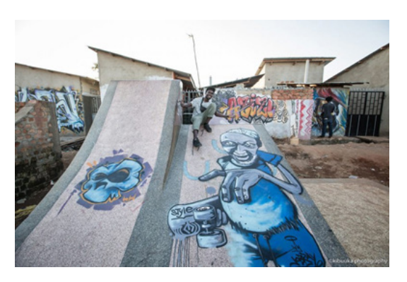
FIGURE 8 One of Jobray's graffiti paintings

example Nyege Nyege festival designs (Letsbebrief, 2018).