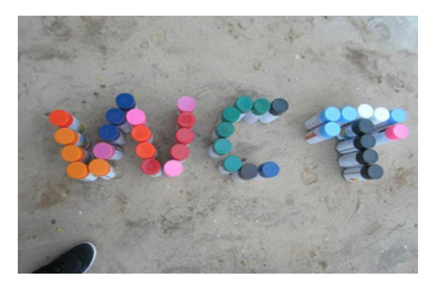
FIGURE 15 Wachata crew tagline

Socialism). During this period, most Tanzanians had no access to western culture, the internet and computer technology (Graffitisouthafrica, 2013).