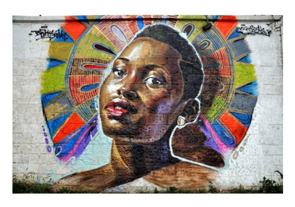
FIGURE 9 Lupita by graffiti artist Bankslave