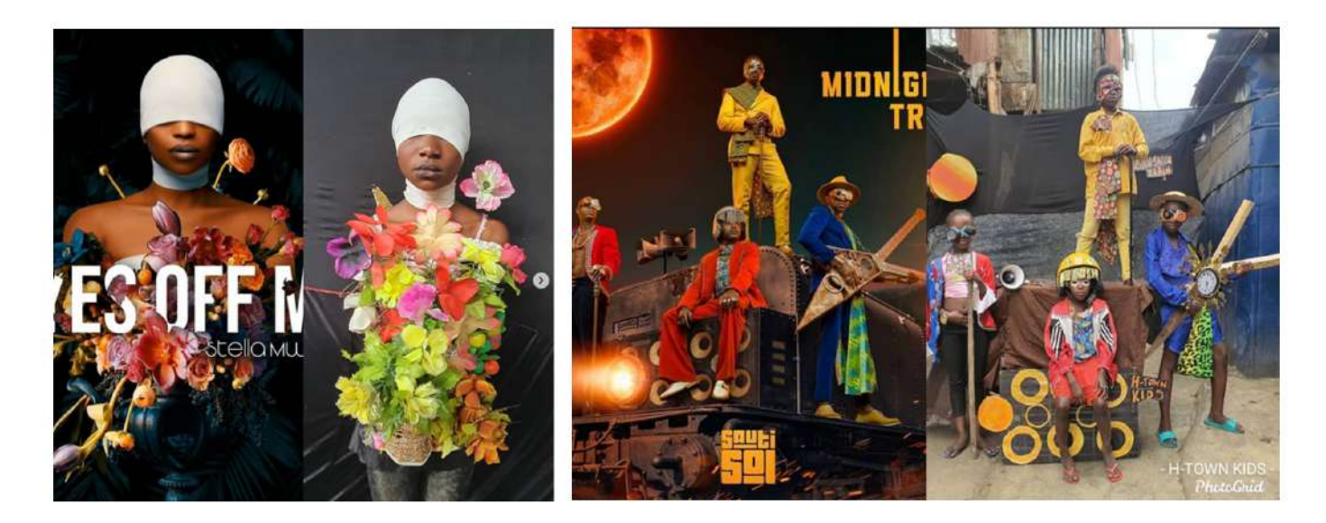
Fig 10. (Left) Mimic of pop artiste Stella Mwangi, Fig 11. (Right) Mimic of a music band, Sauti Sol album cover for 'Midnight Train'.

Stellar acting skills are juxtaposed with imaginative (at time humourous) costume and set design. H-Town Kids use whatever material is at their disposal to ensure their act is as close as possible to the original.