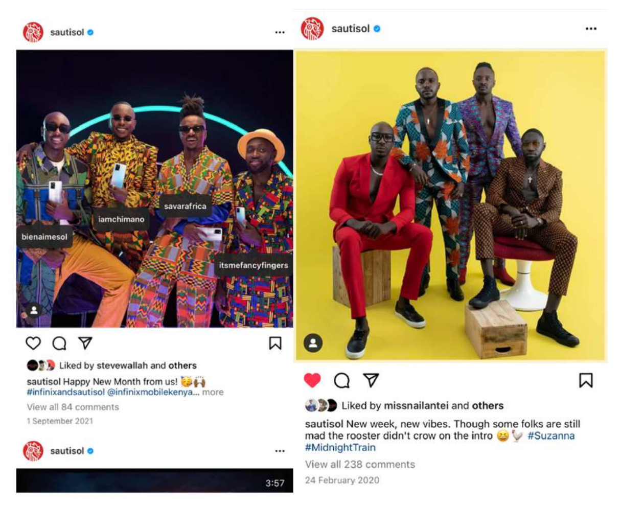
Fig 5 & 6. Images of Sauti Sol wearing Afrikan wear: Source: Instagram@sautisol

4.1.1.4 Minimal staged or orchestrated shoots for advertising - unless it's content crafted for the music band, most digital contents are crafted almost ad hoc; at random and don't sound 'salesy'. User-generated content is screenshot and posted in a slapstick manner.