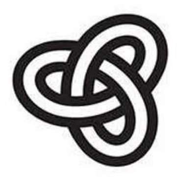
Fig I. The Sustainism symbol, trefoil knot. This symbol explains how in sustainism everything is connected and loops together, a circle of life.

This craving for humans to connect, interact, transact, shop, dine, receive services, is what can be associated with the sustainist school of thought. Built of 4 principles, sustainism is about sharing, localism, connectedness, and proportionality (Diakrousi, A & de Moor, M. 2011). Localism, therefore, becomes an expression of it – with interconnectedness at its core.