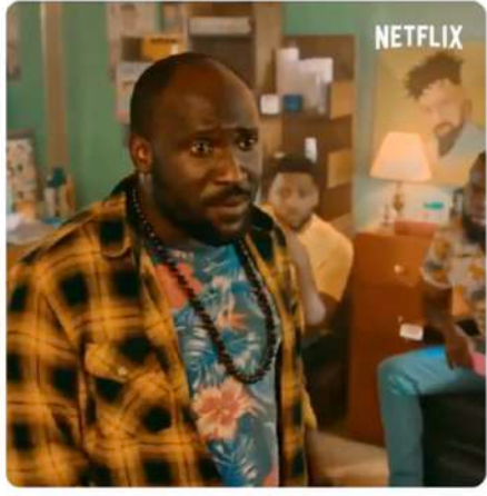
Fig 7. (Left) An announcement web banner of Netflix Kenyan launch campaign

Fig 8. (Right) A still frame from Netflix Kenya's 'Free The Whole Storo' campaign.