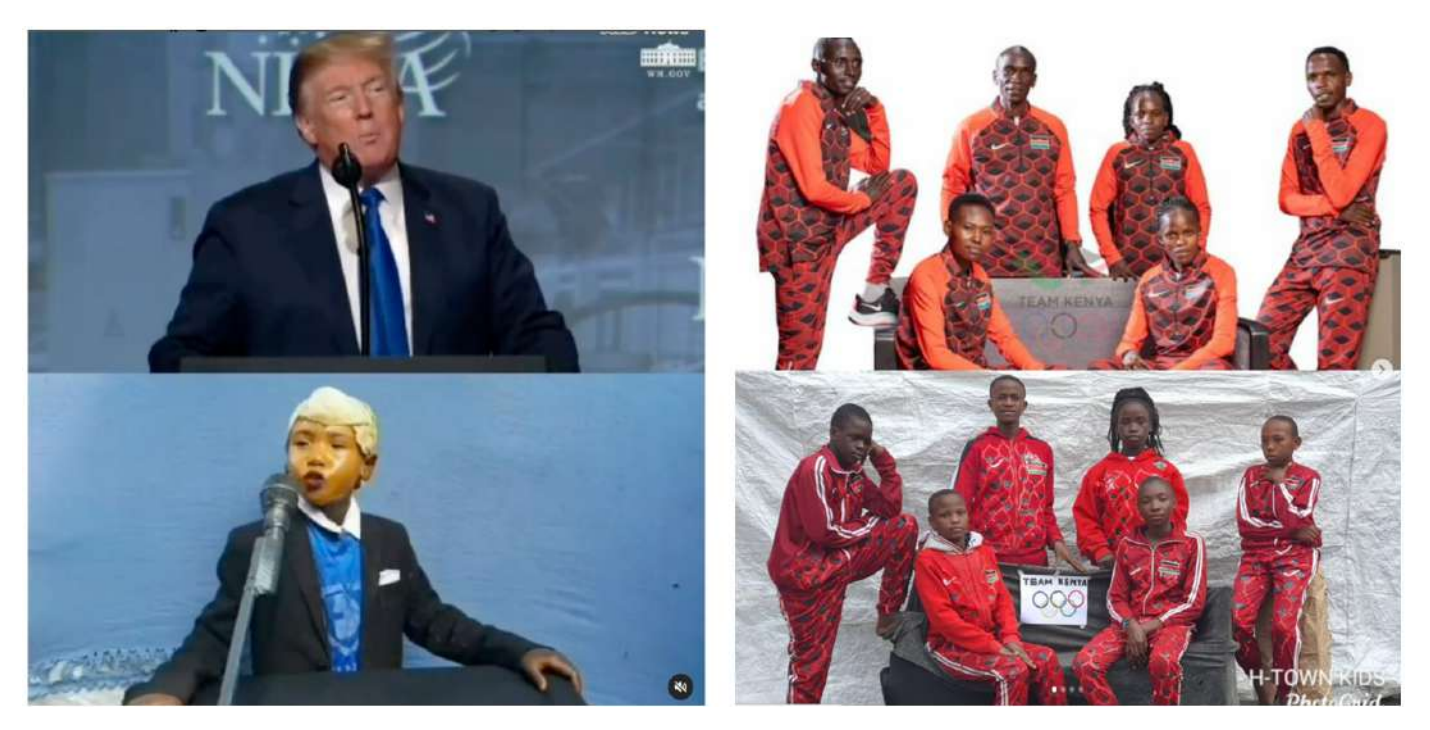
Fig 12. (Left) Mimic of former USA president, Donald Trump. Fig. 13. (Right) Mimic of 2021 Olympic 'Team Kenya'.

So entertaining has their work been that they have attracted global recognition from DJ Khaled who expressed love and admiration for their works.