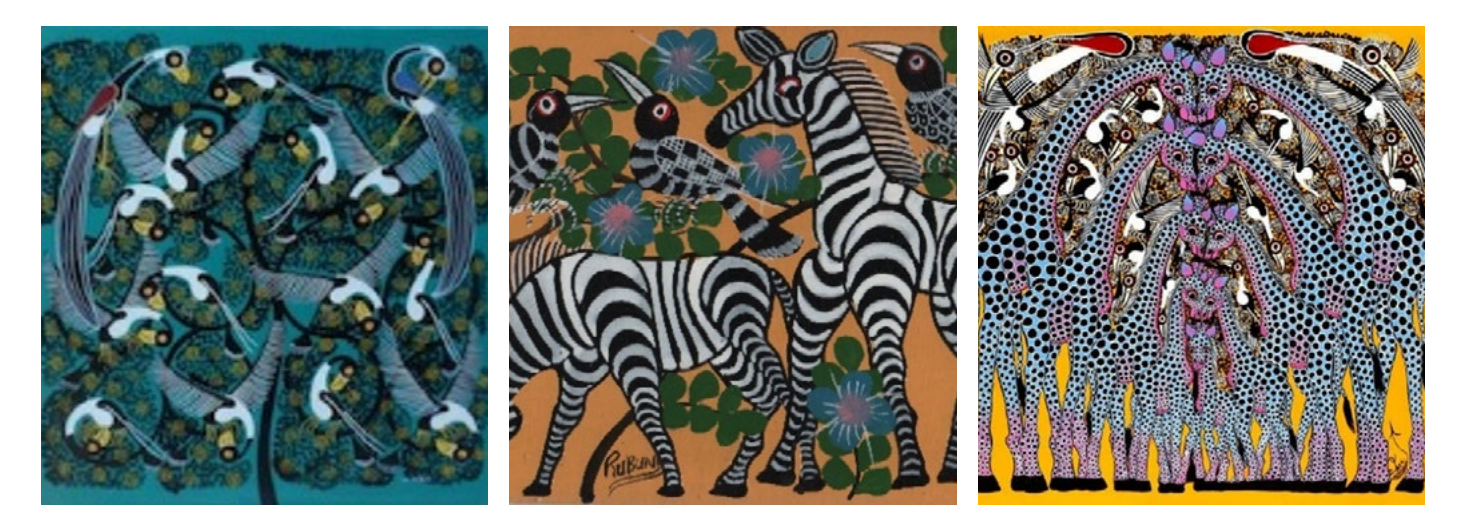
Fig. 11: Untitled by Mwamedi

The paintings are simple and flat with vivid and bright colours, such as reds, oranges, blues, greens, yellows, to name a few being used across the paintings. The backgrounds, if not a landscape, usually consist of gradient backgrounds, as seen in figure 14, or sometimes single solid colours. There is a sense of naivety, surrealism, humour and sarcasm in the paintings, and oftentimes it is explicit