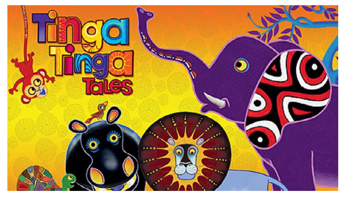
Fig. 18: Tinga Tinga Tales.

The show was produced by Tiger Aspect Productions in conjunction with Homeboyz Animation in Nairobi, Kenya. (BBC, 2010) The music was produced by Kenyan singer-songwriter Eric Wanaina. (BBC, 2010)