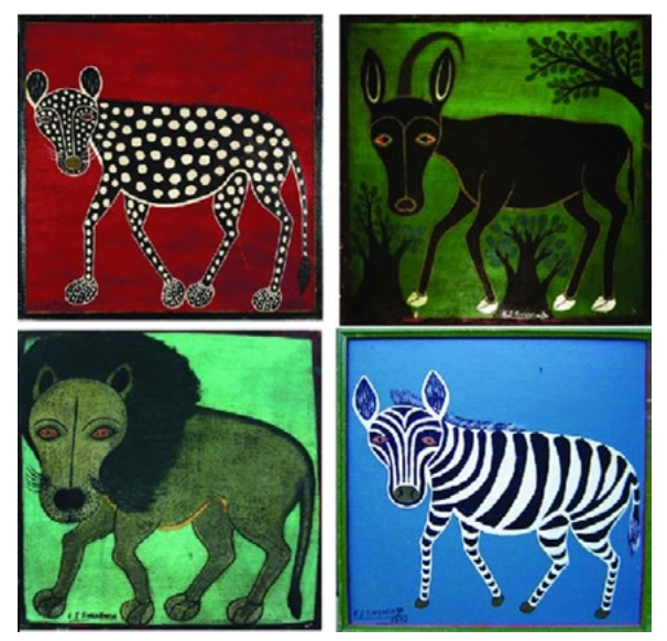
Fig. 3: Group of paintings by E. S. Tingatinga.

Edward's lack of formal training led to a "simple, direct and naïve approach to natural subjects, lacking in nuance and detail but bursting with exuberant life, whimsy and colour." (Indigo Arts Gallery, 2021) His style was naïve, humorous and bordering on surrealistic due to the exaggerated forms of his subjects. (TingaTinga African Art, 2018) The paintings were often colourful, vibrant and at times crowded and flat with a lack of perspective and even lacking depth in a few, as seen in figure 3. (Contemporary African Art, 2018)