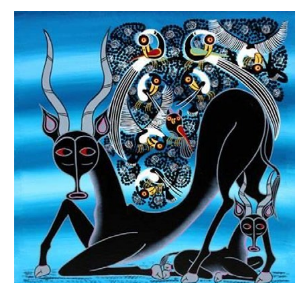
Fig. 16: Untitled by Mwamedi