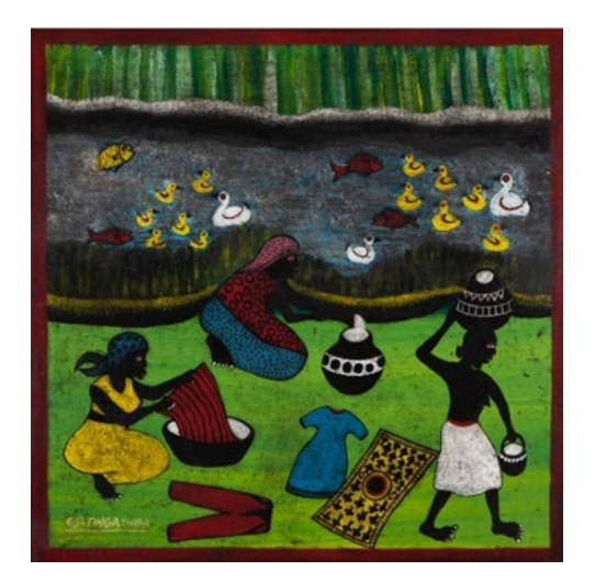
Fig. 6: Untitled (Women washing clothes by the lake) by E. S. Tingatinga.

The subjects for his paintings were drawn from anything and everything around him. From birds to animals such as cheetahs, hyenas, leopards, giraffes, elephants, gazelles as seen in figures 4 and 5. His work also depicted scenes of village life, as seen in figure 6, and landscapes such as that of the savannah. (Another Africa, 2011).