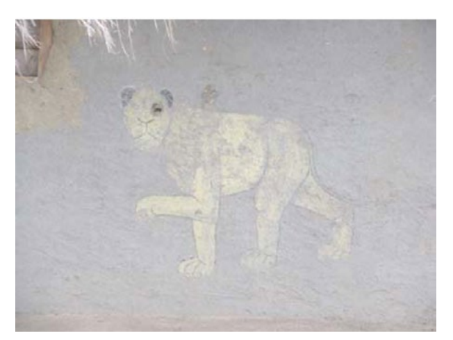
Fig. 8: Wall paintings in Ngapa depict animals in a naïve style that might resemble Tingatinga art

Edward drew his inspiration from his genetic heritage such as folklores from Ndonde or Makua culture and exterior mural wall paintings done on huts by villagers of his tribe such as in figures 7 and 8. (Indigo Arts Gallery, 2021).