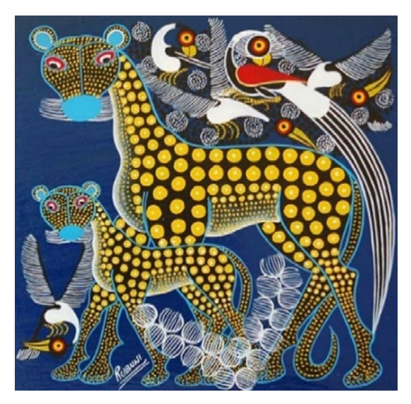
Fig. 17: Untitled by Rubuni