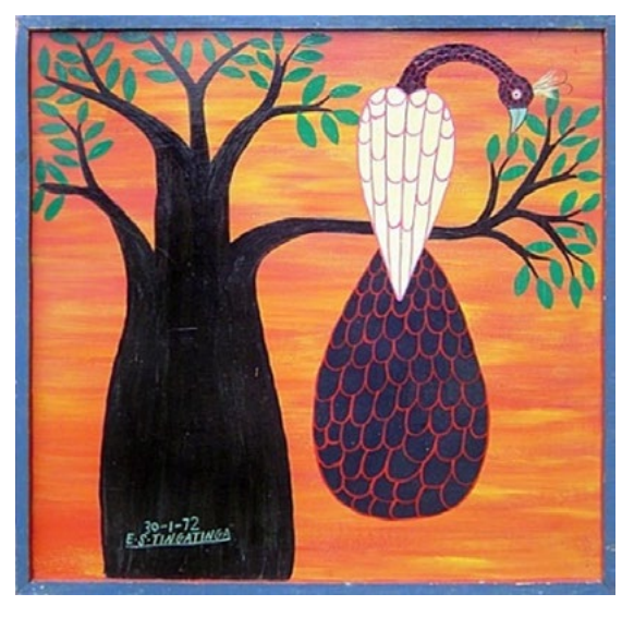
Fig. 9: Peacock by E. S. Tingatinga

The paintings often involve nature with its core subject matter as animals, some often depicted in an exaggerated manner. The animals include hornbills, antelopes, giraffes, leopards, zebras, elephants, peacocks, amongst others as seen in figures 11, 12 and 13.