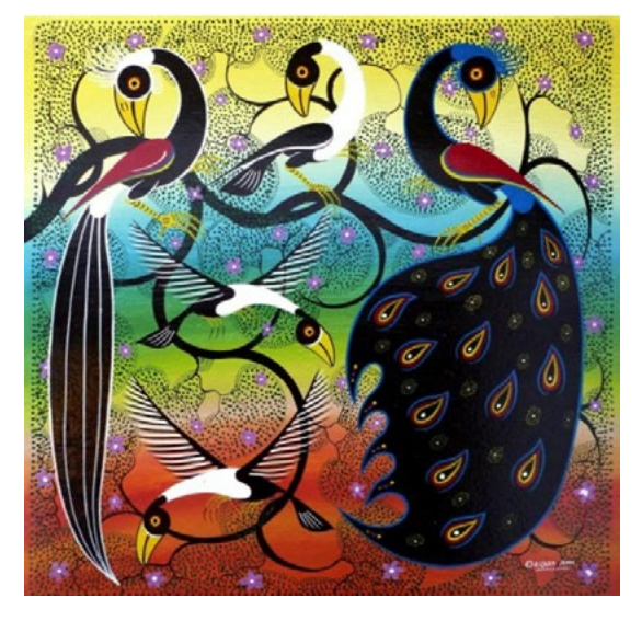
Fig. 10: Peacock in a tree by Kilaka.