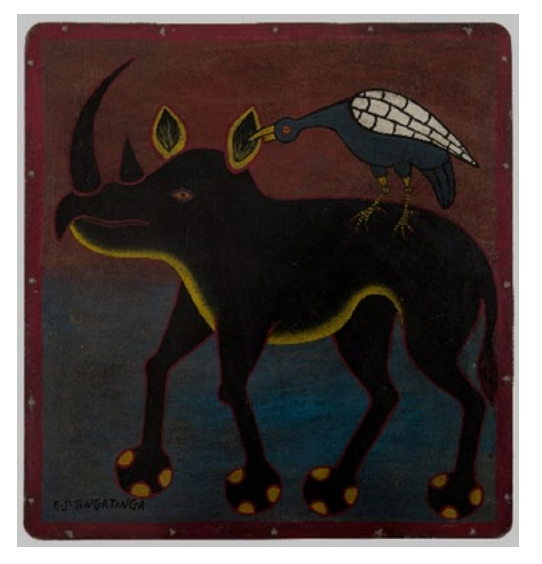
Fig. 5: Untitled (Kifaru/Rhino) by E. S. Tingatinga