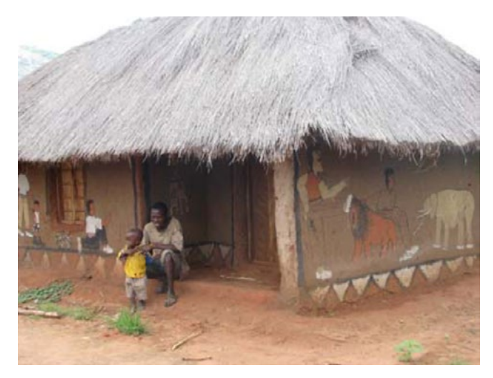
Fig. 7: Wall paintings in Ngapa, the village of E. S. Tingatinga's father