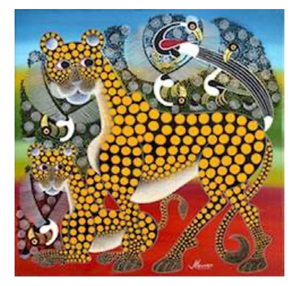
Fig. 14: Untitled by Mkumba

as seen in figure 15. (TingaTinga African Art, 2018) The animals are particularly painted in unique poses, such as in figure 16, that add to the caricature of the animals and some are characterised with dots or circular spots on their bodies as in figure 17, if they usually have spotted skin or fur.