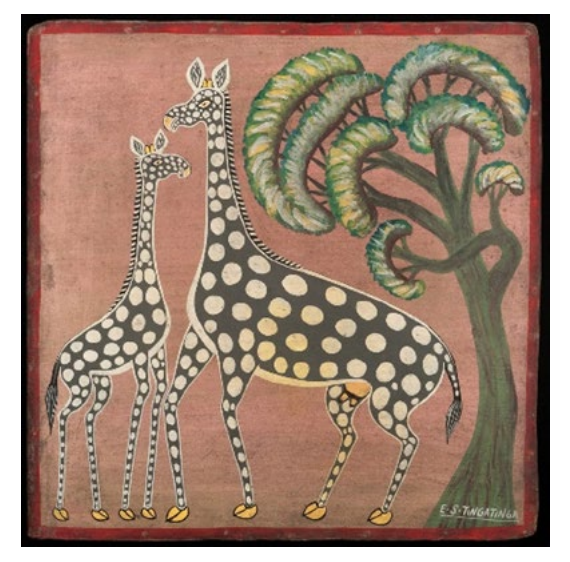
Fig. 4: Untitled (Twiga) by E. S. Tingatinga