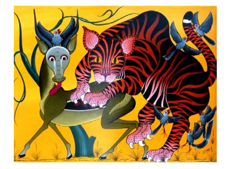
Fig. 15: Aspects of a Tiger by Omary