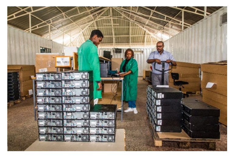
Fig. 7:.Close the Gap Kenya Workshop in Mombasa

Below is an image of the employees at work with IT material.