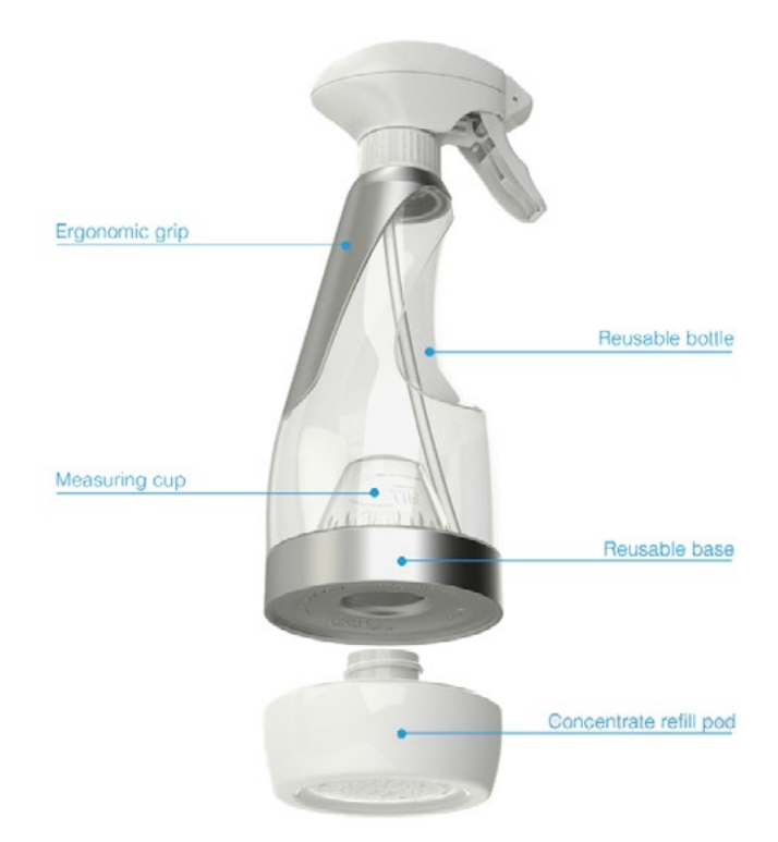
Fig. 3. Replenish spray bottle

Below is the look of the multi-purpose, reusable bottle: