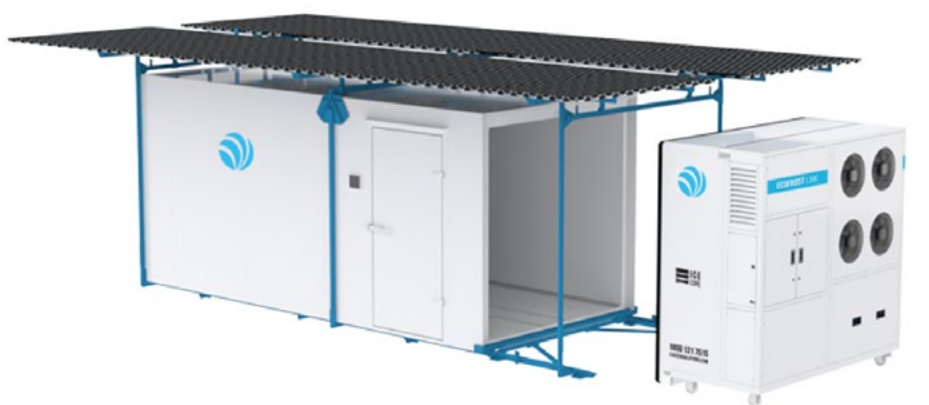
Fig. 6. Soko Fresh container

The following is an image of one of the mobile containers that Soko Fresh Kenya provides for the Kenyan agricultural and horticultural sector.