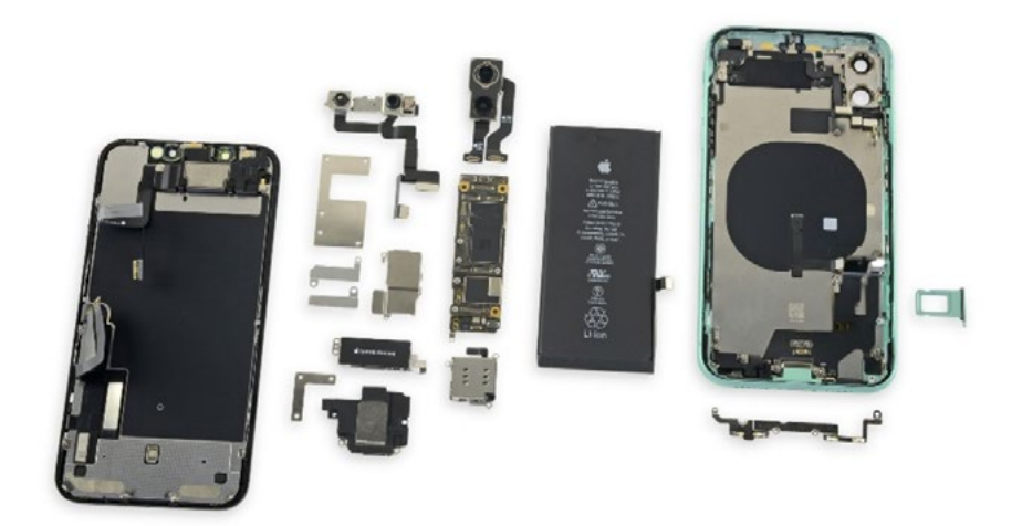
Fig. 2. An iPhone 11, disassembled

Another aspect that is imperative when it comes to waste and pollution elimination is creation of products that are easy to disassemble. For example, a modern cell phone can easily be disassembled for repair to avoid purchasing a new one which could collectively have a negative environmental impact. In terms of economic impact, this system would save resources as well as labour.